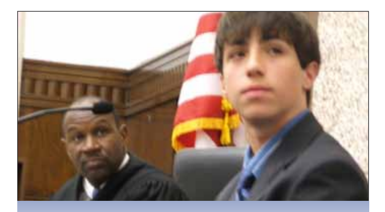
The State Mock Trial Competition involves over 8,000 students and 3,000 judge, lawyer, and teacher volunteers.

participation. In 2009, CRF's Teaching American History (TAH) program provided more than 200 teachers from seven school districts with U.S. history resources designed to support classroom instruction. All TAH resources originate from CRF's U.S. history materials, from scholars connected to local academic institutions, and from an extensive bibliography selected by TAH staff.