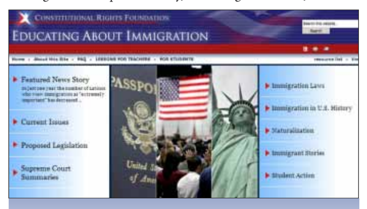
CRF's materials, publications, and web sites reached nearly 2.4 million students annually.

Teacher and Professional Development. Teachers receive training and professional development from CRF through workshops in history, law and government, and civic