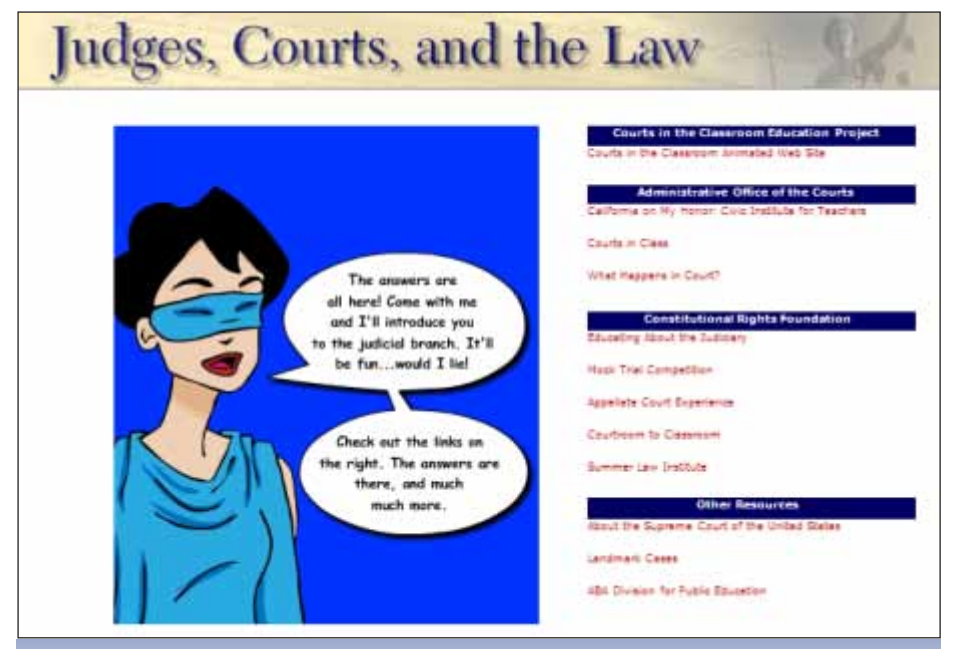
In collaboration with the Judicial Council of California, CRF created the interactive Judges, Courts, and the Law website.