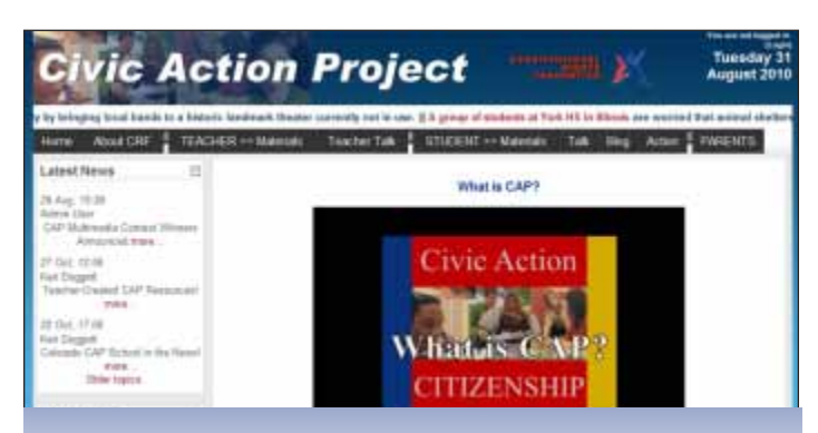
In 2009, CRF field-tested the innovative CAP curriculum that gets students to explore public policy beyond the four walls of the classroom.

The Appellate Court Experience provided students with an opportunity to observe oral arguments in a criminal appeal, meet with presiding justices at the California State Court of Appeal, and engage in classroom activities.