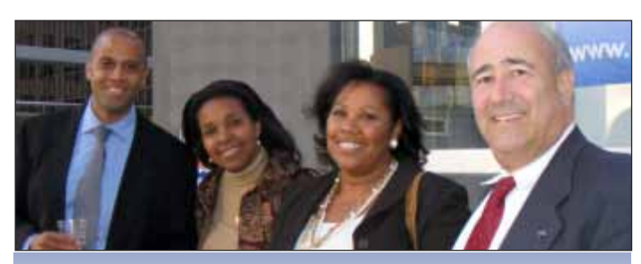
Our Lawyer in the Classroon programs provided students with a deeper understanding of the judicial system by connecting them with members of the legal community.