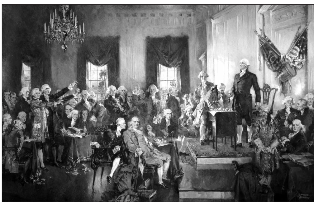
Delegates at the Constitutional Convention wait their turns to sign the U.S. Constitution.

In February 1787, Congress decided that a convention should be convened to revise the Articles of Confederation, the nation's first constitution. In May, 55 delegates came to Philadelphia, and the Constitutional Convention began. Debates erupted over representation in Congress, over slavery, and over the new executive branch. The debates continued through four hot and muggy months. But eventually the delegates reached compromises, and on September 17, they produced the U.S. Constitution, replacing the Articles with the governing docu-