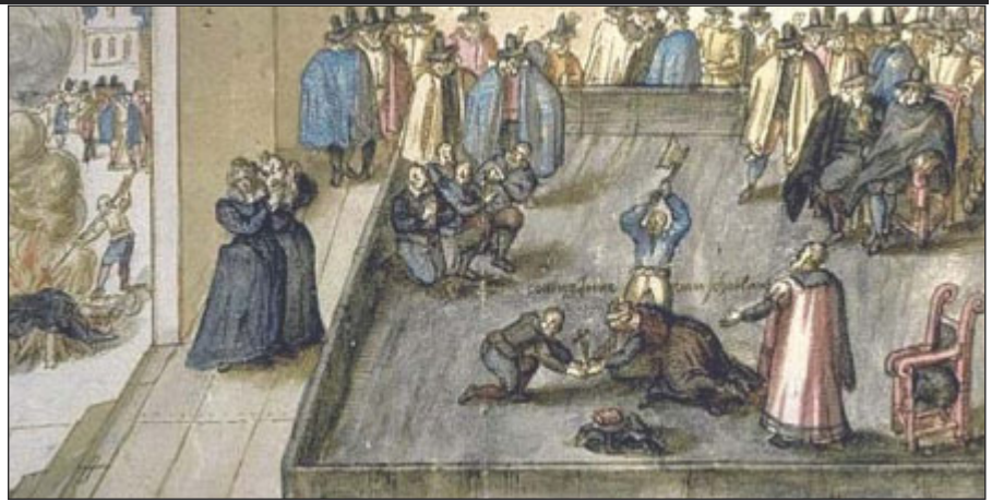
Elizabeth’s Catholic rival, Mary, Queen of Scots was executed in 1587.

Despite the harshness of the Catholic crackdown, Elizabeth insisted there would be no inquisition