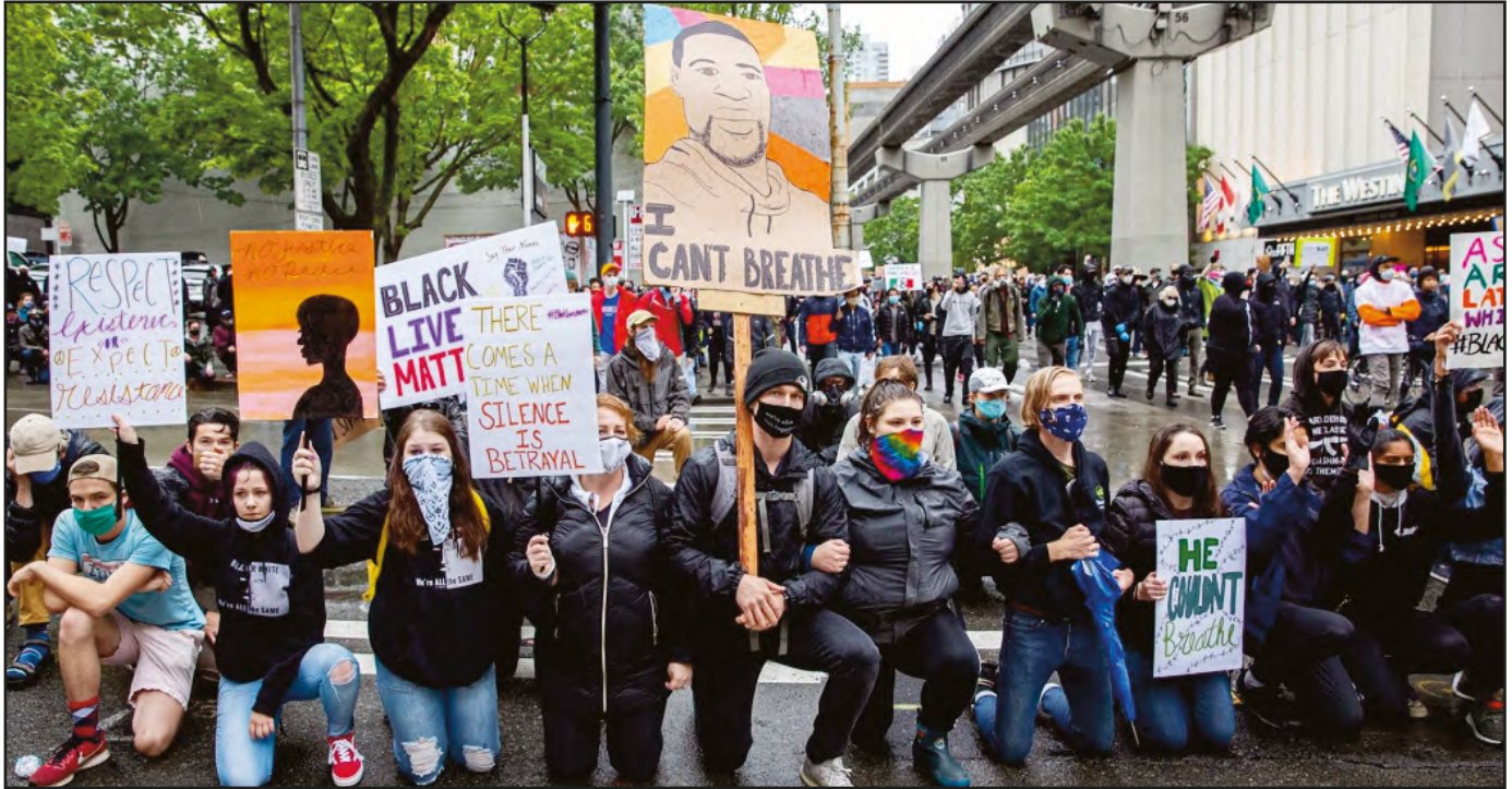
Protesters in Seattle, Washington, marched in response to the death of George Floyd, who was murdered by police in Minneapolis, Minnesota. Multiple polls showed that by July 2020, an estimated 15 million to 26 million people had demonstrated in response to George Floyd's death.